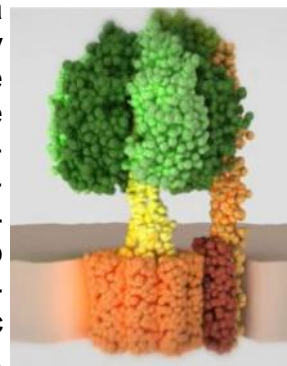
ATPase as seen in CMI's animation 7