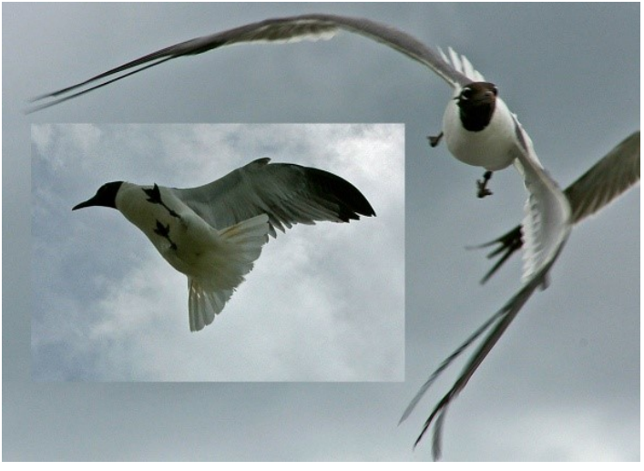
Maneuvering Laughing Gulls

In short, every aspect of creatures that fly shouts out "I was designed!". So the next flying creature you see, even the pesky fly, remember to marvel at God's infinite, awe inspiring design. And also remember Matthew 6:25-33 ("Look at the birds of the air .... Are you not much more valuable than they?")