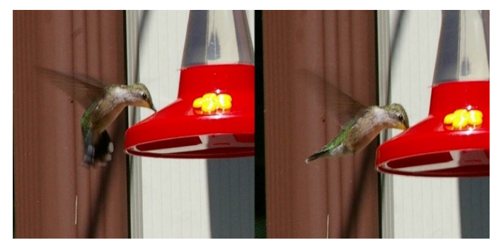
Moving hummingbird tail

ast issue, I covered the miraculous me-⊿ chanics of flight, the beautiful way God designed birds to enable flight. But that still is not enough to guarantee flight. You still need something called stability and control, which simply means getting the aerodynamics right. Everyone has heard about the modern technological marvels that the increasingly popular quad copters are. But most don't realize the extensive sophisticated design process that has gone into making them automatically controllable. Without that design, your everyday person would have never been able to fly one. If it has taken mankind so long to be able to design and build these flying machines, what does that say for our creator who has designed myriads of much more sophisticated flying creatures in one day?