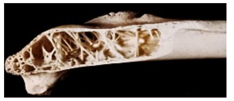
several types of feathers all on one bird. You not only have primary, secondary and tertiary feathers, but also specialty feathers such as one called the alula, or finger feather. The alula sits on the leading edge of the wing acting just like leading edge spoilers on aircraft wings

Next of course are feathers. But there are